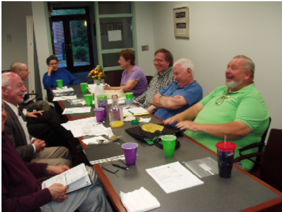
This photo was taken at the recent board meeting in May. The board is obviously working very hard as you can from the expression on their faces.