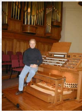
John Friesen Bedient Organ, Saint Paul