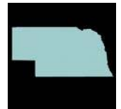
Nebraska District Convener