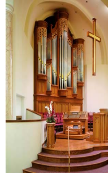
Bedient Organ Saint Paul