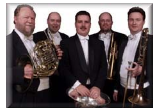
The Palladium Brass