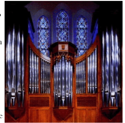
Reuter Organ - First Presbyterian Church