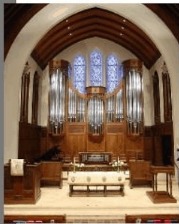
LINCOLN NEBRASKA JULY 6 - 11, 2008