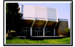
Kimball Recital Hall

General admission $5; Student/senior $3. *