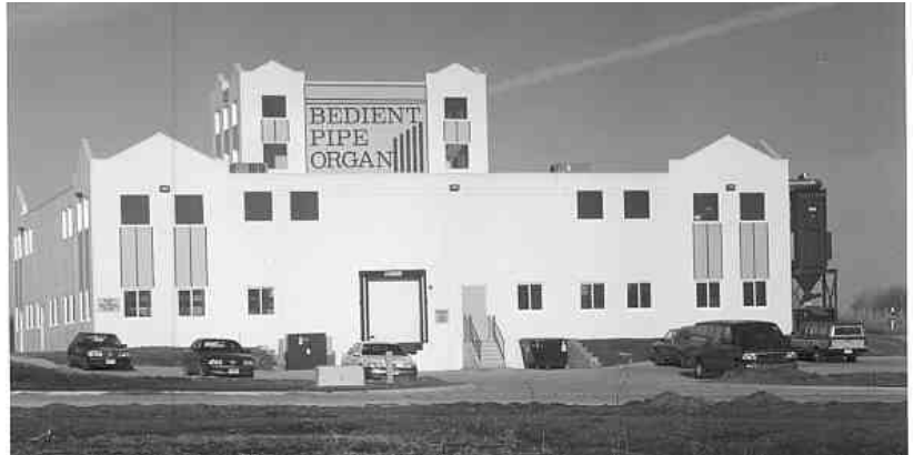
Bedient Organ Company