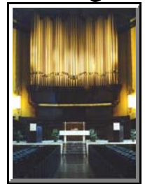
Lied Organ at First-Plymouth